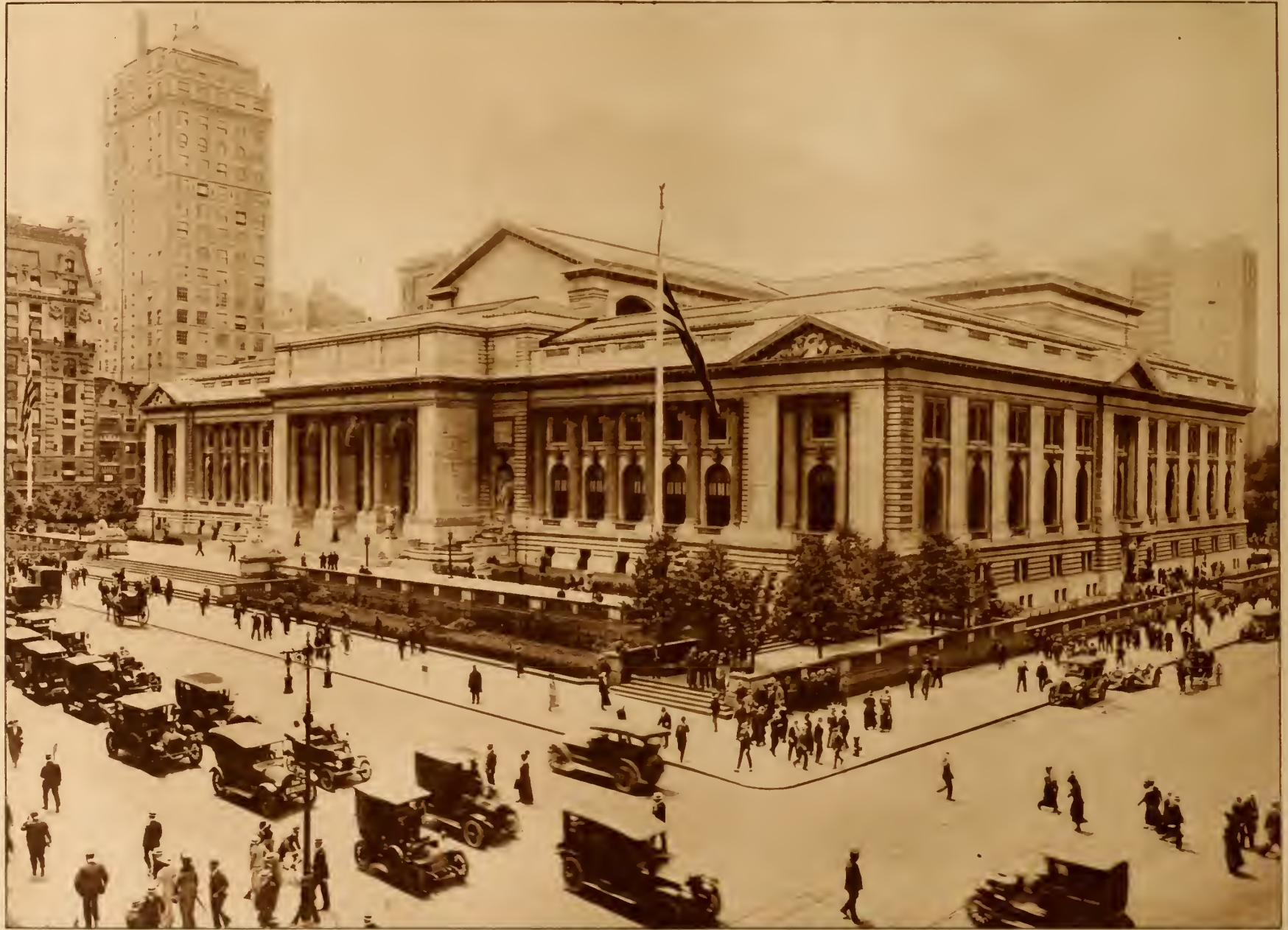
NEW YORK PUBLIC LIBRARY, facing 5th Avenue, between 40th and 42nd Streets. Magnificent structure completed in 1911, at a cost of $9,000,000. It combines the Astor, Lenox and Tilden libraries, and contains hundreds of priceless books and manuscripts. The building is built of Vermont marble. Has nearly 2,000,000 volumes. Art gallery on upper floor.